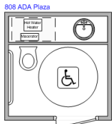
Drawing not to scale.