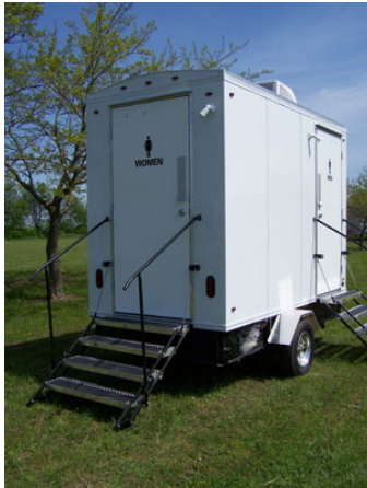
610 Traditional Dooley

Attractive, rugged, highly functional commercial grade restrooms trailers. Designed for cost effective heavy duty use. 18 floor plans and a choice of color combinations.