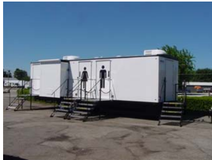
830 Traditional with Slide Outs

Note: This trailer features a hydraulically operated slide out sink providing more interior room on both the men's and women's sides.