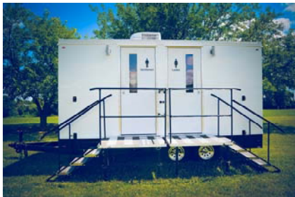
Shown with optional side mount porch steps

Rugged strength of our commercial trailers with a range of designer interior packages Provides a quality refined look for special events requirements Greater range of exterior colors Upgraded lighting and wood trim with powder coated steel partitions Over 10 upgraded interior color combinations Multi source sound system with customizable playlists Fold up steps standard with optional porch step available Standard high efficiency A/C and optional heat package Over 30 years' experience goes into each trailer manufactured