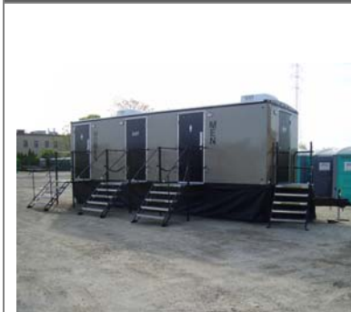
Shown with optional side mount porch steps

Rugged strength of our commercial trailers with a range of designer interior packages Provides a quality refined look for special events requirements Greater range of exterior colors Upgraded lighting and wood trim with powder coated steel partitions Over 10 upgraded interior color combinations Multi source sound system with customizable playlists Fold up steps standard with optional porch step available Standard high efficiency A/C and optional heat package Over 30 years' experience goes into each trailer manufactured