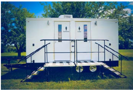
Show with optional side mount porch steps

Rugged, dependable, functional, and luxurious The quality looks and materials of a fine hotel Amish crafted vanities and solid surface countertops Wood framed mirrors with upgraded lighting Fully enclosed individual suites with stile and rail hardwood doors and trim Multi source sound system with customizable playlists Over 10 upgraded interior color combinations Choice of exterior colors Over 30 years' experience goes into each trailer manufactured