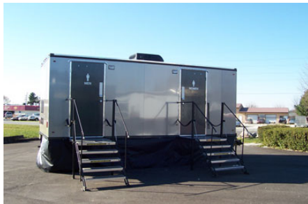
Shown with optional porch steps

Rugged, dependable, functional, and luxurious The quality looks and materials of a fine hotel Amish crafted vanities and solid surface countertops Wood framed mirrors with upgraded lighting Fully enclosed individual suites with stile and rail hardwood doors and trim Multi source sound system with customizable playlists Over 10 upgraded interior color combinations Choice of exterior colors Over 30 years' experience goes into each trailer manufactured