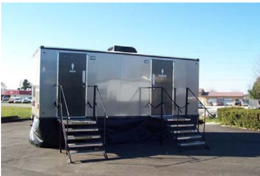
Shown with optional porch steps and canvas skirting

Rugged, dependable, functional, and luxurious The quality looks and materials of a fine hotel Amish crafted vanities and solid surface countertops Wood framed mirrors with upgraded lighting Fully enclosed individual suites with shaker style hardwood doors and trim Multi source sound system with customizable playlists Over 10 upgraded interior color combinations Choice of exterior colors Over 30 years' experience goes into each trailer manufactured