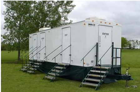
Shown with optional canvas trailer skirts

Rugged, dependable, functional, and luxurious The quality looks and materials of a fine hotel Amish crafted vanities and solid surface countertops Wood framed mirrors with upgraded lighting Fully enclosed individual suites with Shaker style hardwood doors and trim Multi source sound system with customizable playlists Over 10 upgraded interior color combinations Choice of exterior colors Over 30 years' experience goes into each trailer manufactured