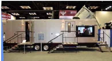
Shown with optional side mount porch steps and custom enclosed television cabinet

Rugged, dependable, functional, and luxurious The quality looks and materials of a fine hotel Amish crafted vanities and solid surface countertops Wood framed mirrors with upgraded lighting Fully enclosed individual suites with shaker style hardwood doors and trim Multi source sound system with customizable playlists Over 10 upgraded interior color combinations Choice of exterior colors Over 30 years' experience goes into each trailer manufactured