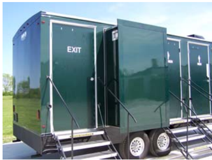
832 Royale with Slide-Out

Note: This trailer features a hydraulically operated slide out sink providing more interior room on the women's side.