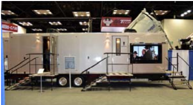
Shown with optional side mount porch steps and custom enclosed television cabinet

Rugged, dependable, functional, and luxurious The quality looks and materials of a fine hotel Amish crafted vanities and solid surface countertops Wood framed mirrors with upgraded lighting Fully enclosed individual suites with shaker style hardwood doors and trim Multi source sound system with customizable playlists Over 10 upgraded interior color combinations Choice of exterior colors Over 30 years' experience goes into each trailer manufactured