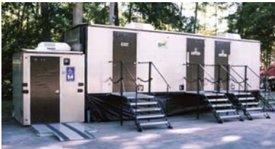
Shown with optional porch steps and canvas skirting

Rugged, dependable, functional, and luxurious. The quality looks and materials of a fine hotel, plus the strength of an Ameri-Can engineered trailer. Individual suites with stile and rail doors and coordinating wood trim and cabinetry.