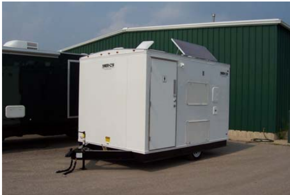
Shown with optional solar package

Greater range of exterior colors Upgraded lighting and wood trim with powder coated steel partitions Over 10 upgraded interior colors Multi source sound system with customizable playlists Over 30 years' experience goes into each trailer manufactured