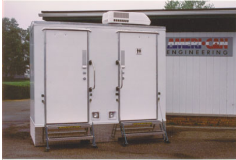
610 Traditional Plaza FW

Attractive, rugged, highly functional commercial grade Designed for cost effective heavy duty use Range of exterior colors Choice of interior color combinations Standard high efficiency A/C and optional heat packages