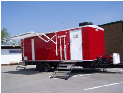
Shown with optional awning

Attractive, rugged, highly functional commercial decontamination trailers Designed for cost effective heavy duty use Range of exterior colors Fold up steps standard with optional porch step available Standard high efficiency A/C and optional heat packages Over 30 years' experience goes into each trailer manufactured